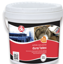
Duralatex (20 L)