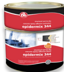
Epidermix 344 (1 L)