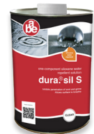
Durasil (5 L)