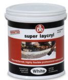
Superlaycryl Fibrated (1L)