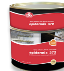
Epidermix 372 (1 L)