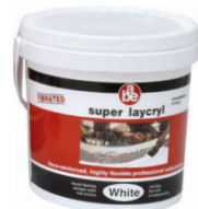
Superlaycryl Fibrated (5L)