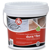
Duraflex (5 kg kit) Duraflex (15 kg kit)