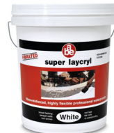
Superlaycryl Fibrated (20L)