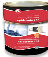
Epidermix 344 (5 L)