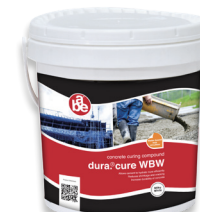
Duracure (20 L)