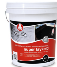
Superlaykold (20 L)