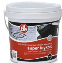
Superlaykold (5 L)