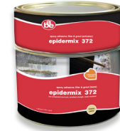
Epidermix 372 (5 L)